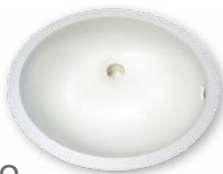
1512VO 15-1/2" x 12-5/8" x 3-1/2" Deep Bowl with overflow