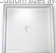
ADA3636 Solid Surface Shower Pan