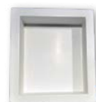
RTS1214 Toiletry Shelf

HIGH QUALITY. LOW COST. EXTREME VERSATILITY.