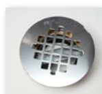
PF140NC Brass Shower Drain