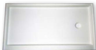
SP3260 Solid Surface Shower Pan Left, Center or Right Drain