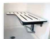
Phenolic Fold-down Shower Seat