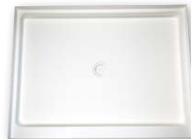
SP3648 Solid Surface Shower Pan

901.386.2375 | 1.877.778.1149 | www.arraysurfaces.com