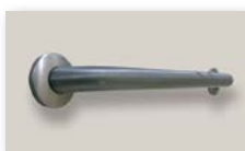
BR182 Grab Bars - 18", 24", 30", 36", 42", 48"