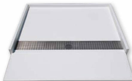
ADA Compliant Ramp