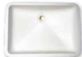
1812VO 18" x 12-3/4" x 5" Deep Bowl with overflow