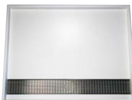
ADA3642TD Solid Surface Shower Pan with Trench Drain