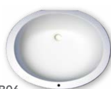
B06 17" x 14" x 5-1/4" Deep Bowl with optional overflow