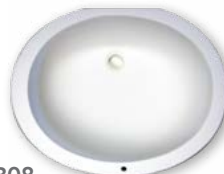
B08 19" x 15" x 5-3/4" Deep Bowl with optional overflow