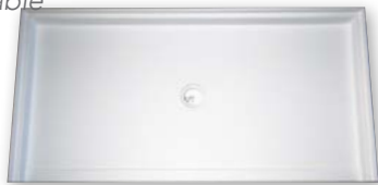
ADA3060 Solid Surface Shower Pan