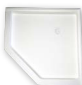
SP3636N & SP4242N Solid Surface Shower Pan