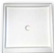
SP3636 & SP4242 Solid Surface Shower Pan