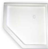
SP3636N & SP4242N Solid Surface Shower Pan