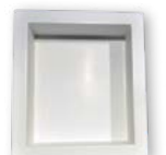
RTS1214 Toiletry Shelf

HIGH QUALITY. LOW COST. EXTREME VERSATILITY.