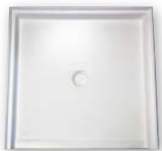
ADA3636 Solid Surface Shower Pan