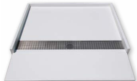
ADA Compliant Ramp