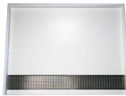
ADA3642TD Solid Surface Shower Pan with Trench Drain